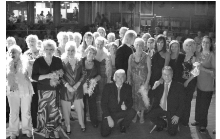
Breast Friends ladies with The Fourmost