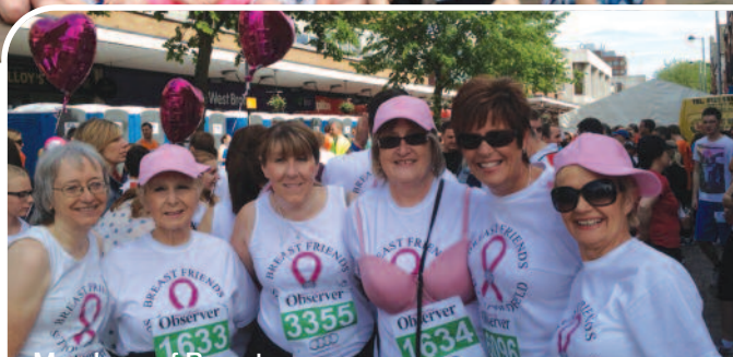
Members of Breast Friends Committee