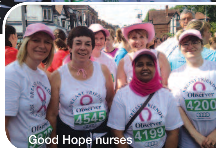
Good Hope nurses