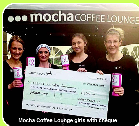
Mocha Coffee Lounge girls with cheque

Thank you to all the stallholders, the local shops, the choir, the entertainers, and the thousands of people who attended on the day and donated...we are so very grateful to you all.